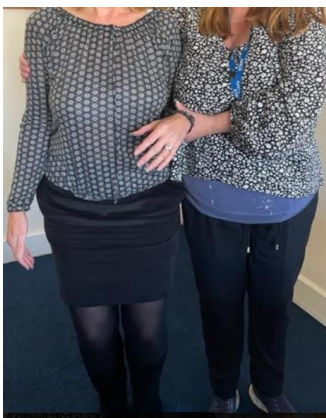
Reference: Escort 4