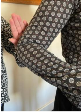
Reference: Prompting 1