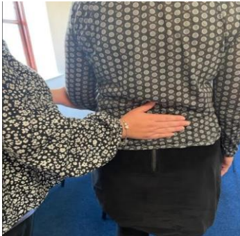
Reference: Guiding 3