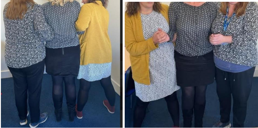
Reference: Double cup hold 5