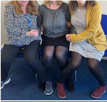
Reference: Seated kicking position 8